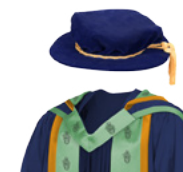
Doctor of Philosophy