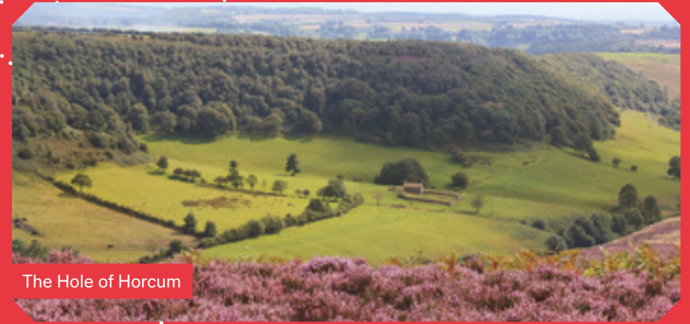
The Hole of Horcum