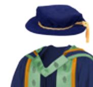
Doctor of Philosophy