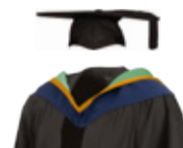
Undergraduate Certificate / Diploma / Foundation

For York St John University graduation ceremonies mortar boards are not worn during the ceremony but may be worn following the conferral of all awards or when processing out of the Minster