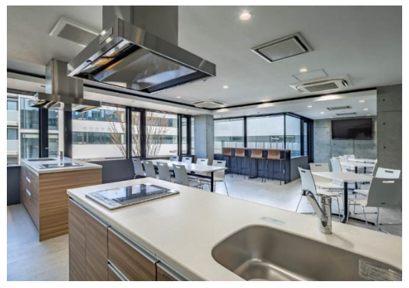
Shared Living / 共有リビング