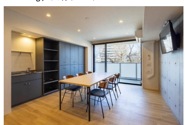
5. Dormy Nishi-Kasai 3 / ドーミー西葛西 3