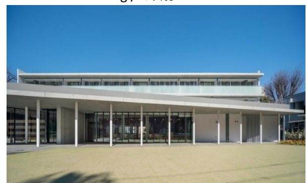
Common living room / 共有リビング