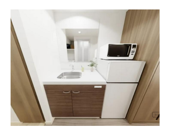
4. Meiji Global Village / 明治大学グローバル・ヴィレッジ