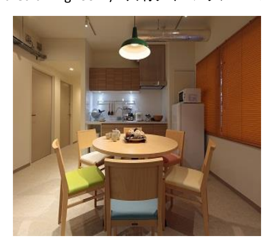
Shared dining room / 共有ダイニングルーム