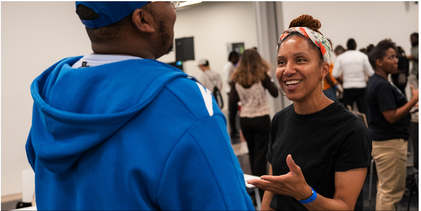
Figure 1 Photo of people talking & smiling at the first Beats and Boroughs event.

Or visit this link: http://bit.ly/4uHbcUD