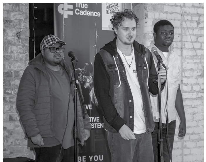
Figure 4 Young people from The Progress Project performing at Beats and Boroughs' Future Sounds: Youth, Music and Community event at The Boathouse Studios, Barking and Dagenham.

Beats and Boroughs set out to develop a co-produced network of young musicians, artists and organisations to support young people's creative futures, foster collaboration and generate insights about how to best support young people in music industry education and employment. It did this to address a lack of access to music activities and employment for ethnically diverse and low-income young people in East London.