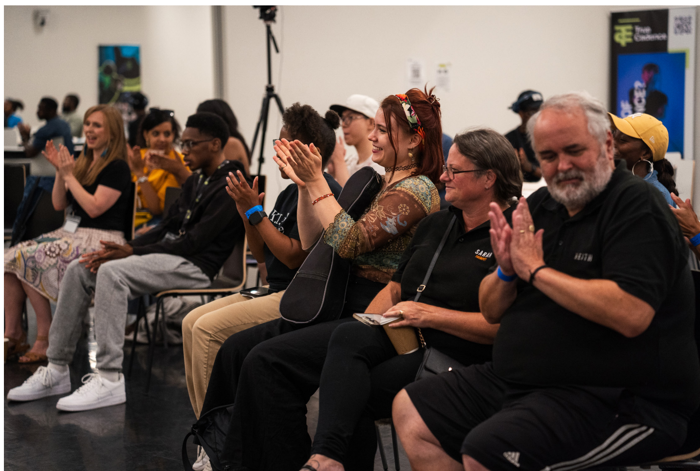
Figure 7 Attendees applauding at Beats and Boroughs' Funding and Sustainability in Community Music event held at Studio Wayne McGregor, Newham.