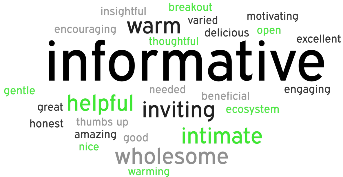
Figure 3 Event attendee responses to the question 'describe today's event in one word'. Answers collated at first 3 events. The size of the word corresponds to frequency of mentions.