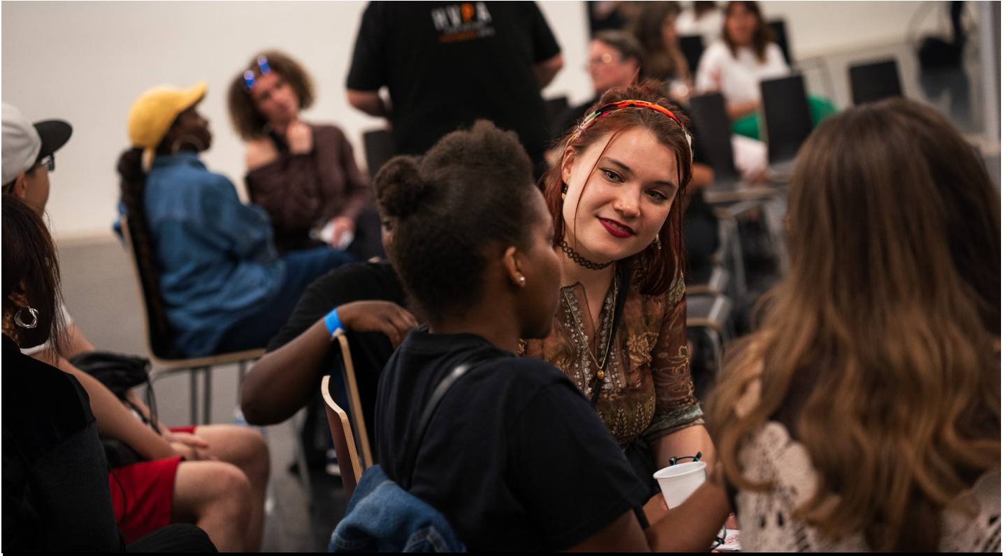
Figure 9 People talking during a networking moment at Beats and Boroughs' Funding and Sustainability in Community Music event.